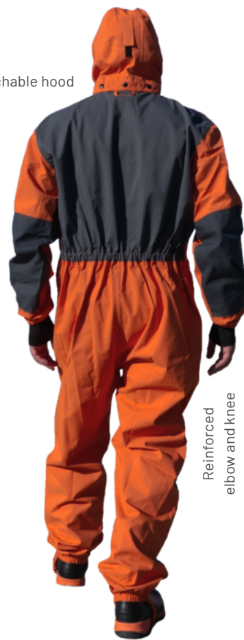
Reinforced elbow and knee